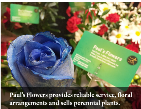
Paul's Flowers provides reliable service, floral arrangements and sells perennial plants.