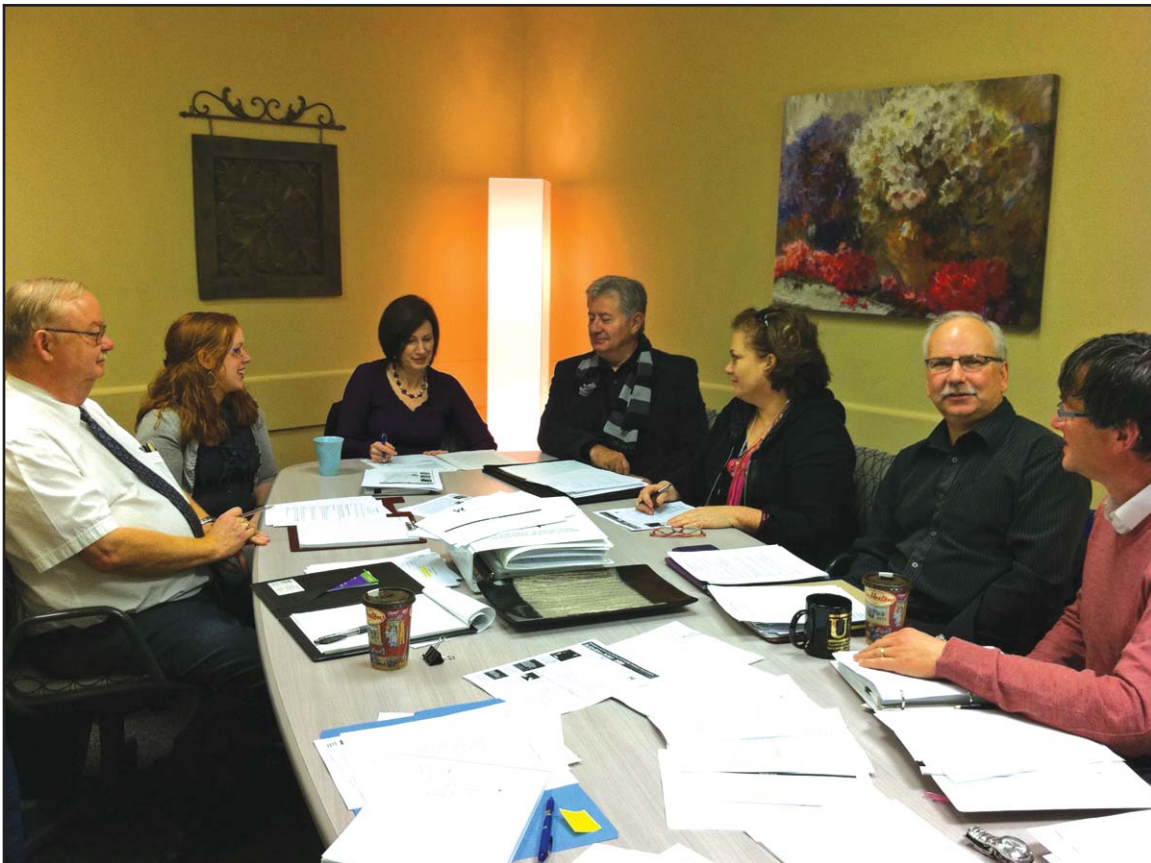
Members of the PAC Admin Committee at work