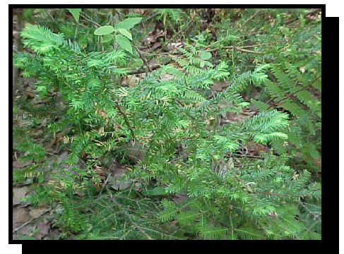
Figure 2. Ground Hemlock is usually found in hardwood stands, particularly in wetter areas. It is most common in Prince County