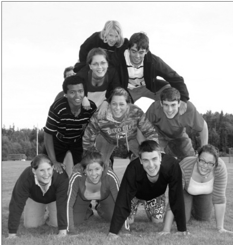
Youth in Care - Summer 2006

In 2006/07, The Department of Social Services and Seniors provided residential services for 109 children and youth in Prince Edward Island.