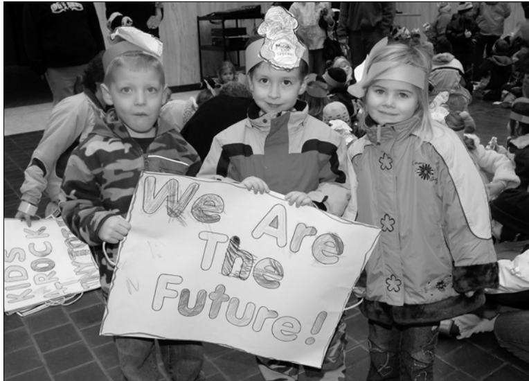
Healthy Child Development Strategy Announcement - 2006/07

In 2006/07, there were 4824 early childhood spaces in 141 licensed childcare centres in Prince Edward Island.