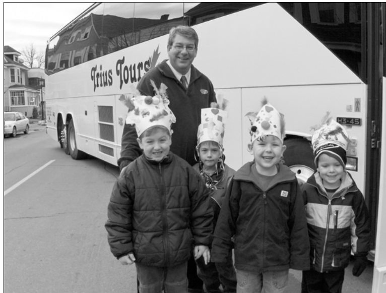
National Child Day Parade, November 2006

The Child and Family Services Division provides a broad range of services to promote the safety and well-being of the children and families of Prince Edward Island. These services are directed towards: strengthening family and community resources to increase the capacity of individuals and/or families for more independent functioning; protecting the rights and well-being of children where efforts of the family have been unsuccessful; providing supports for individuals and families who lack the resources to deal with crisis events/situations in their lives.