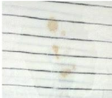
after SPRAYING WITH FAUX "SHOUT"