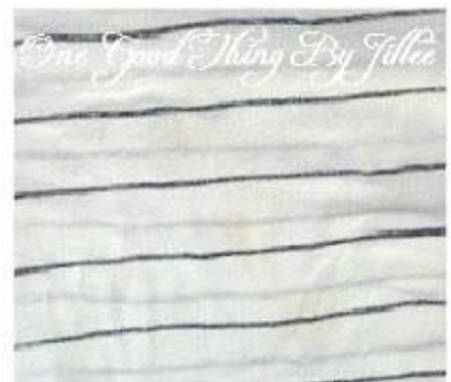
after RUBBING THE FABRIC TOGETHER!