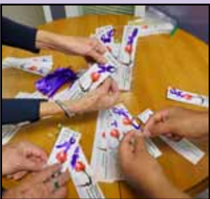
Many hands make light work! Volunteers pin 17,000 purple ribbons to bookmarks each year.