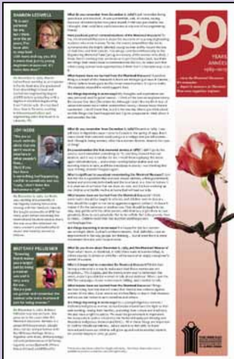
Interviews with women of three generations and cultural backgrounds, remembering 30 years since the Montreal Massacre. Full interviews available at peiactsw.wordpress.com .