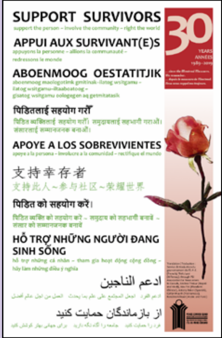
2019 Purple Ribbon multilingual poster.

Apply to be appointed to the PEI Advisory Council on the Status of Women through the Government of PEI, Engage PEI: www.princeedwardisland.ca/en/information/executive-council-office/engage-pei