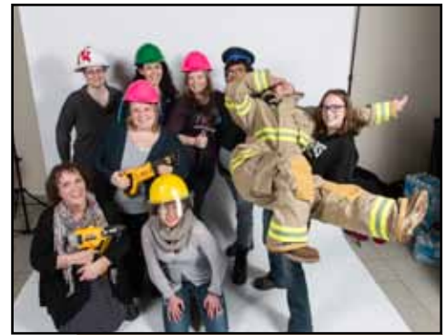
Trade HERizons

A focus group member with a disability said too large a proportion of human rights complaints on PEI “are employment discrimination based on ability. This is disability discrimination.”