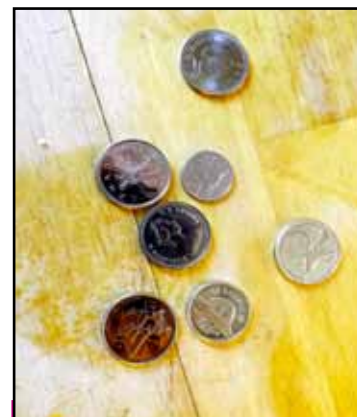
Time for Change

"No one at financial services can teach low-income people how to budget the amount they are given. Because it is just not possible... I would like to issue a challenge to financial assistance to come up with a (sample) budget that could be scrutinized... Between you and me, there is just no way it stretches."